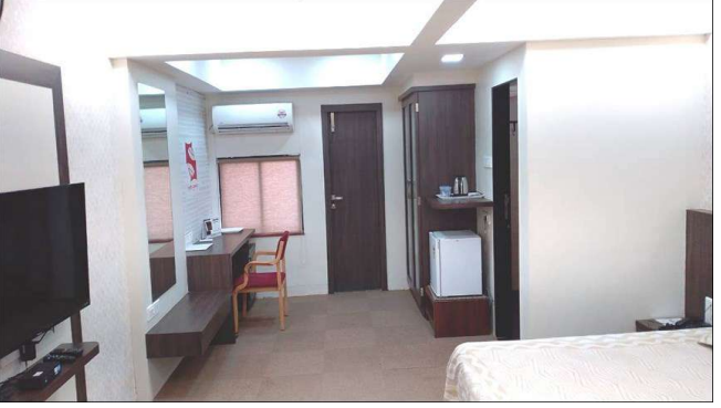
Guest House Room