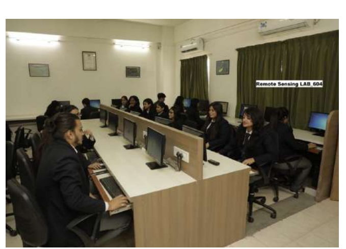
GIS & RS Lab